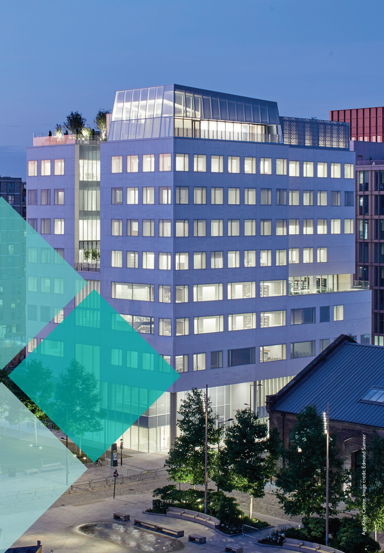
Aga Khan Centre.