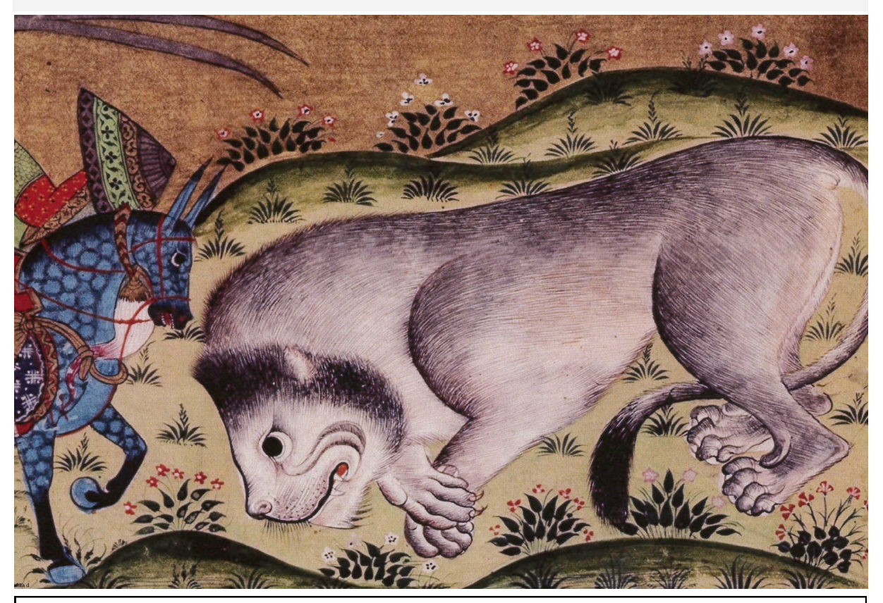
The legacy of Imam 'Ali. "This detail miniature painting is from a manuscript of the Khavar-nama , a poem narrating the deeds of Imam 'Ali, made in Punjab in the 11th/17th century."

Beginning from his statement that "dhikr is a polish for the hearts (jila'an li'l-qulub)," Imam 'Ali discusses in a sermon included in