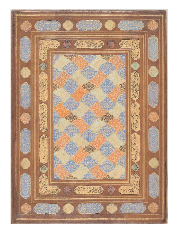
Binding from a Qur'an manuscript. Safavid Iran, mid-16th Century CE. From the collection of The Aga Khan Museum .

Stefan Wild (Chapter 13) looks at the contemporary context, exploring the translation of the Qur'an in the twentieth and twenty-first centuries, and the ways in which the translation of the Qur'an can enter the realms of ideology, theology and politics. Wild concludes that translations are now a part of wider Islamic culture, far outnumbering editions printed in Arabic, typifying the global aspect of contemporary Islam.