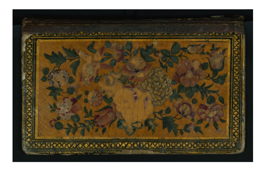
19th century CE lacquer binding of The Qur'an. From the collection of The Walters Art Museum.