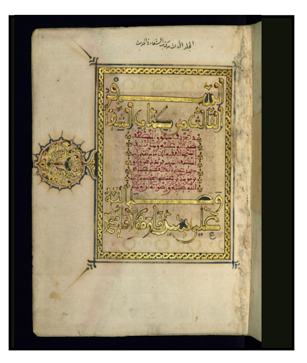
Page from the third volume of Kitab al-Shifa ' by 'Iyad al-Yahsubi. The inscription states that it is the third volume of the book of al-Shifa ' in the hadith. 12th century AH/18th century CE.