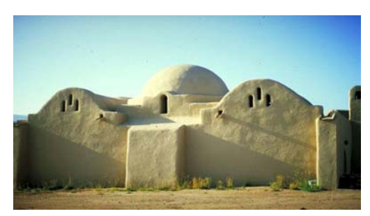
Dar al-Islam Albiqui, New Mexico, United States

The plans for the mosque, which were soon completed, called for the building to be constructed of material indigenous to New Mexico: adobe and brick. The technique of