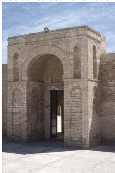
Mahdiyya, mosque, portal, completed 921 in Arts of the City Victorious: Islamic Art and Architecture in Fatimid North Africa and Egypt by Jonathan M Bloom, p. 27.

Between Revolution and State is a significant contribution to Fatimid history and a valuable addition to both Ismaili and Islamic studies.