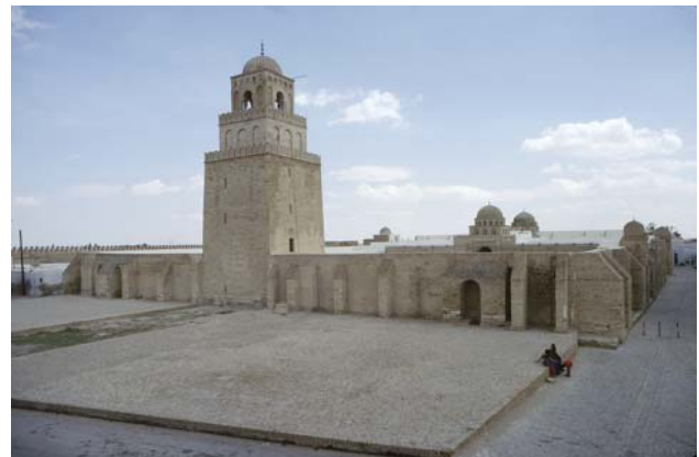
Kairouan Mosque in Arts of the City Victorious: Islamic Art and Architecture in Fatimid North Africa and Egypt by Jonathan M Bloom, p. 20.

The image the Majalis provides of al-Mu'izz's political career is impressive and consistent with the Islamic ideal of the just ruler: triumphant yet tolerant, knowledgeable and wise, able to provide the moral and political guidance that was exemplified by the Prophet and his family. The traditional and often mythic expressions of Twelver Shi'i hagiography, preoccupied with the eschatological and soteriological function of an imam in occultation, are here countered by a very human and accessible portrait of a real historical figure. (Hamdani, 111).