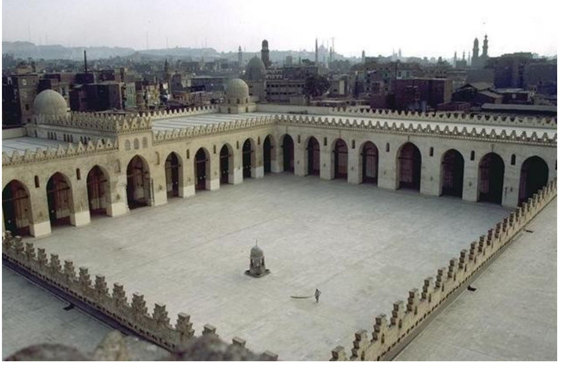
Figure II: Al-Hakim Mosque, Cairo, Egypt.

In the story of Noah and the ark, for example, the prophet (Noah) summons all people to the ark to seek refuge and protection. The ark is none other than the imam and Noah is inviting the people to the imam . Another example can be seen during the life of Abraham. Abraham glorified the fire which 'was an indication for the glorification of the light of the imamat ' (p.79). There was also the glorification of the Ka'ba indicating that 'the imamat was to be in Abraham's house and progeny' (p.79). Finally, when Prophet