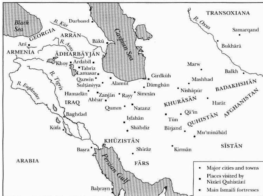
Persia and Adjacent Regions in the 7th/13th Century

From Surviving the Mongols: Nizari Quhistani and the Continuity of Ismaili Tradition in Persia . London, 2002.