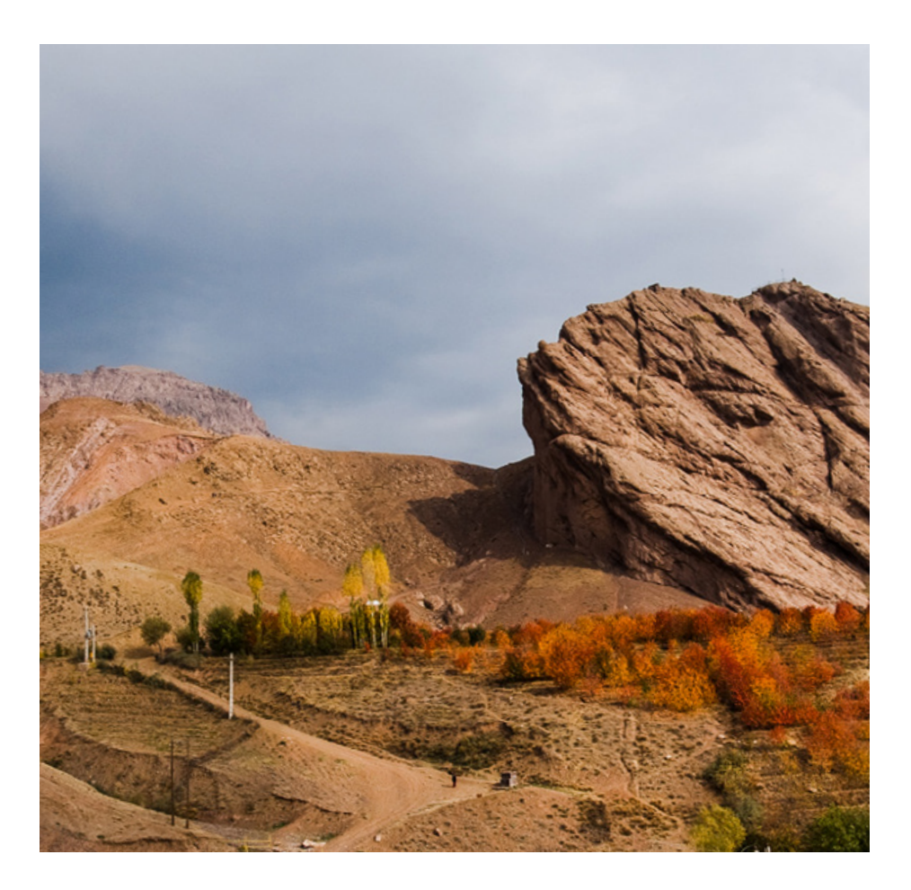
A contemporary view of the Rock of Alamut (ca. 2012).