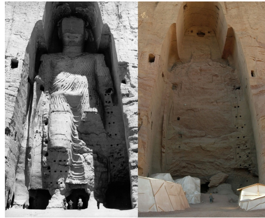
The taller Buddha of Bamiyan before (left picture) and after destruction (right).