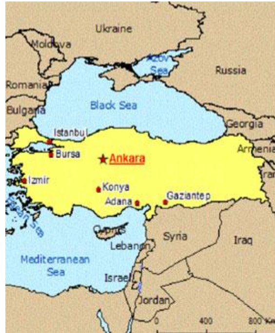
A map showing Turkey at the crossroads of the East and West.