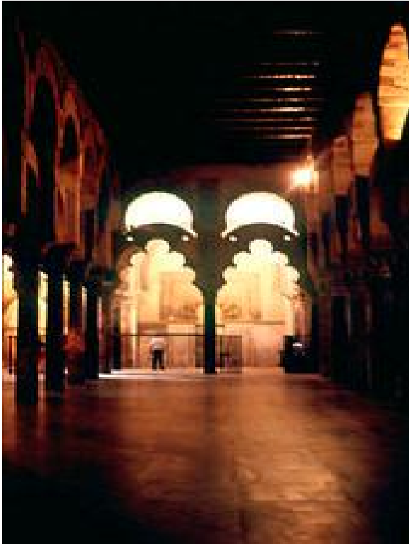
The interior view of the prayer hall of the Great Mosque of Cordoba, which was later converted into a Church following the Spanish Reconquista.

(c) Mary Alice Torres, 1990, Courtesy of the Aga Khan Visual Archive, MIT. This material may be protected by copyright law (Title 17 U.S. Code).