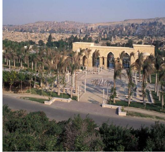
Al-Azhar Park in Cairo depicts an alternative view of modernity — a modernity that is also Muslim.

The author singles out five themes which serve as a guide to understanding the idea of modernity, including modernisation,