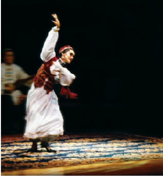
A performer in AKMICA's International Performance and Outreach Programme.